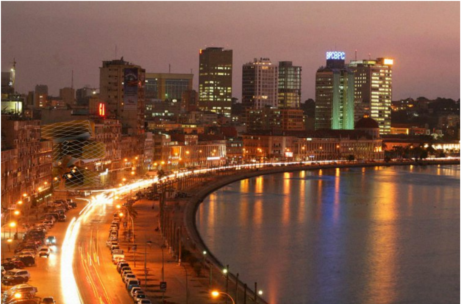
Luanda Bay, Angola

By Lula Ahrens on December 2, 2012 — Angola's capital Luanda is the world's most expensive city for expatriates, according to research bureau Mercer. Yet somewhere between 75% and 85% of its residents live in slums. How do Angolans get by with such skyrocketing prices?