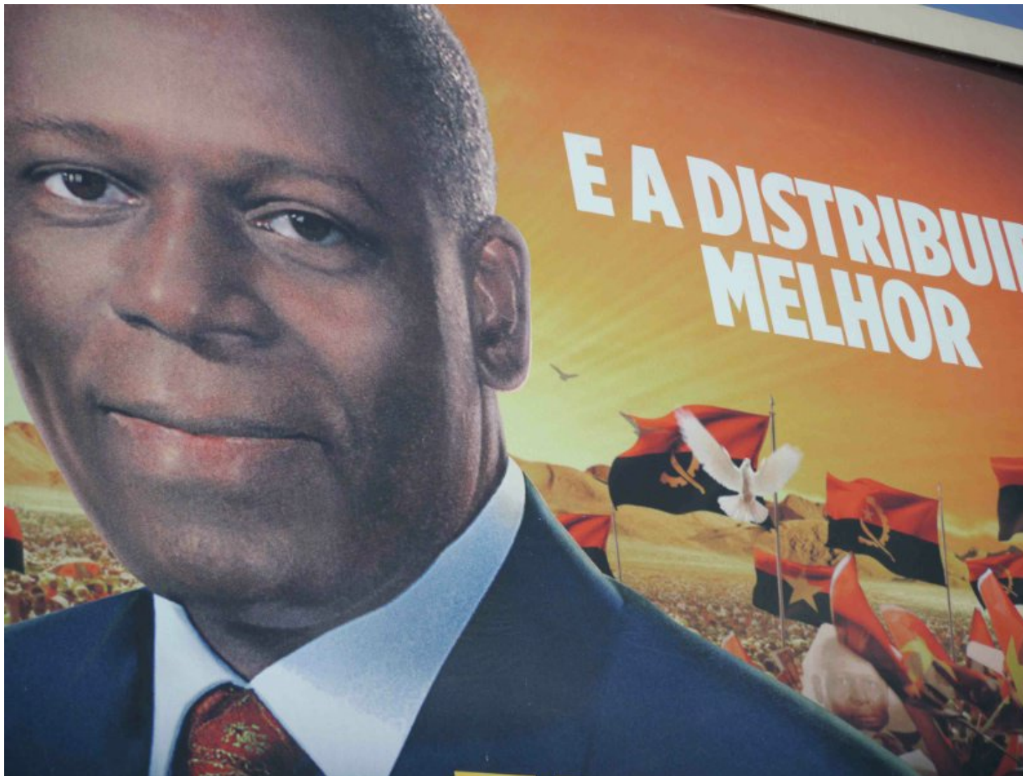
Angola's president Jose Eduardo dos Santos. The billboard reads: "Distributing better".

to people's rescue when drought hits the capital. The business is too lucrative for those involved for them to want to improve the city's running water supply, an anonymous embassy source told This is Africa .